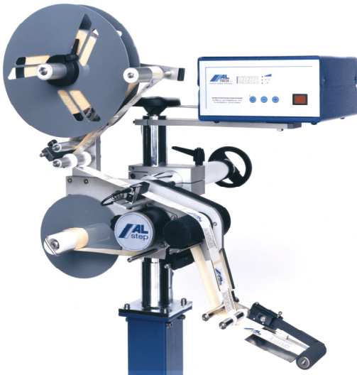
Standard machine: dispensing speed up to 30 m/min